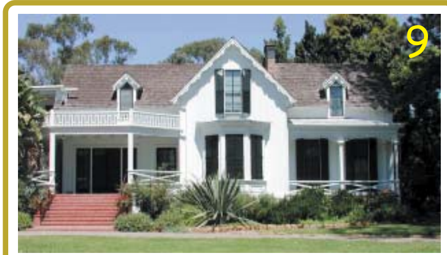
This building was home to a family that ranched in Goleta.