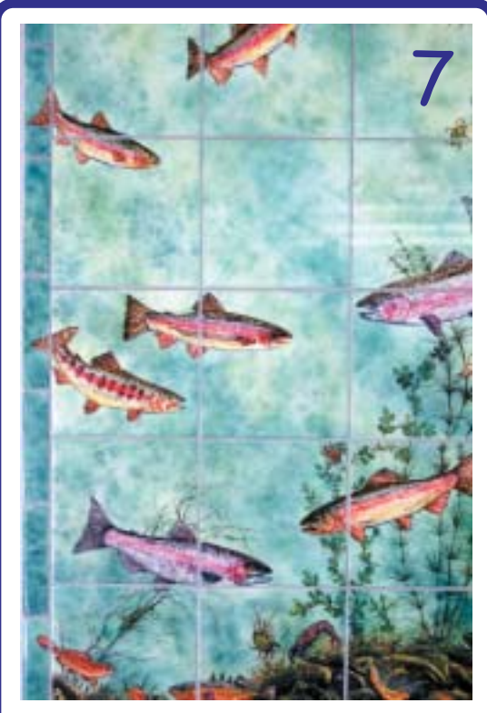
At this location you can learn what you can do to keep our creeks and ocean clean!