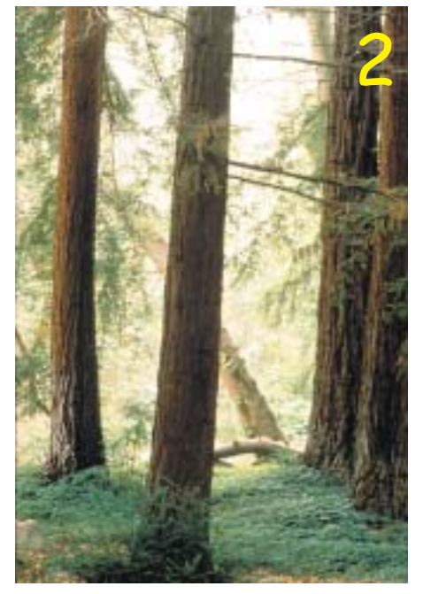
Where near Santa Barbara can you walk in a forest of coast redwood trees? The tallest trees in the world are redwoods that are more than 300 feet in height.