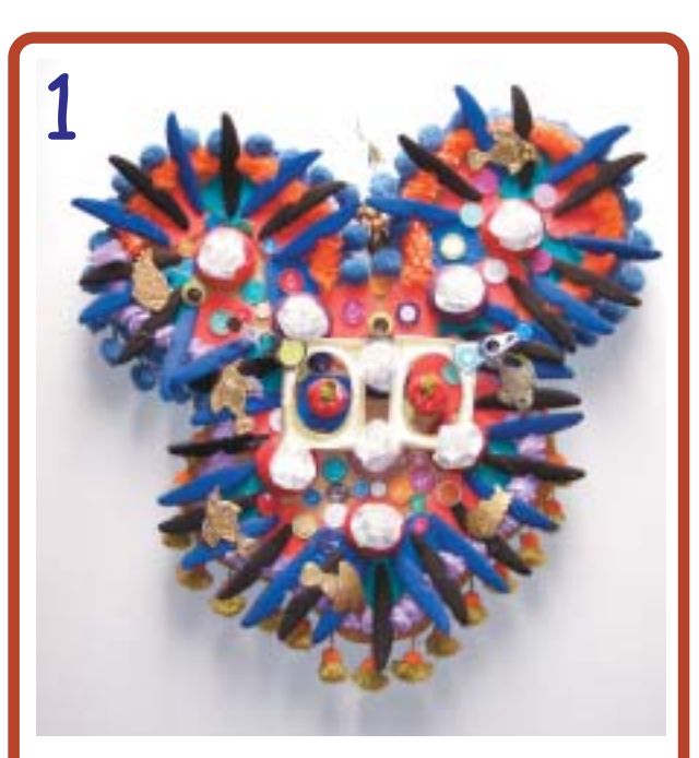
Here you can learn about recycling and create your own work of art — like this!

Can you identify each of the museums and other fun places depicted in the photographs below? Choose from the list on the right. Answers are at the bottom of the page.