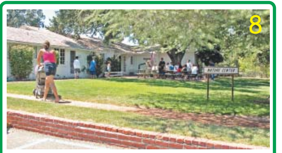
Visit this place to see birds and animals that live near where you live.

Where can you find two stripes that merge into one?